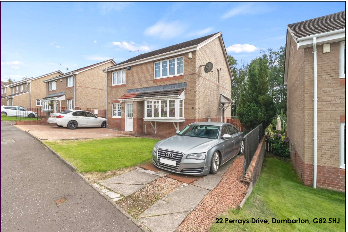
22 Perrays Drive, Dumbarton, G82 5HJ

The agents are delighted to bring to the market this 2 bed semi-detached. Offering versatile accommodation over two levels with the potential to extend to the rear (subject to planning permissions). The property benefits from gas fired central heating and double glazing.